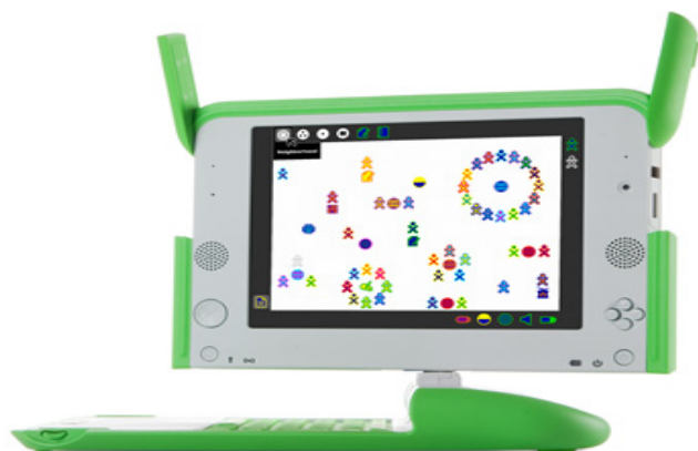
Fig 2 100$ laptop XO (www.laptop.org)

100$ laptop project, is an educational initiative runs by One laptop per Child(OLPC) a non-profit organization, it’s mission is to “create educational opportunities for the world's poorest children by providing each child with a rugged, low-cost, low-power, connected laptop with content and software designed for collaborative, joyful, self-empowered learning. When children have access to this type of tool they get engaged in their own education. They learn, share, create, and collaborate. They become connected to each other, to the world and to a brighter future”. (www.laptop.org) by applying the basic hardware computing function and incorporating free online cloud computing service for underprivileged children. This small laptop-XO reflects the disruptive potential for future education service in poor countries.